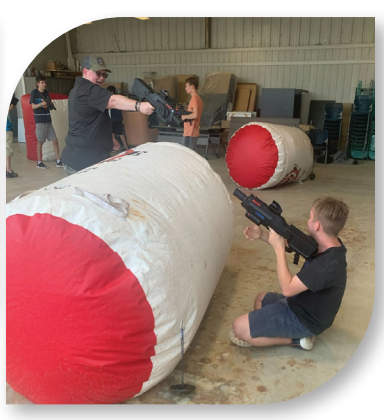
Pictured left to right: Come As You Are Prom, client holding a baby kangaroo when the creature teacher came to teach us about different animals, and a friendly game of mobile laser tag in our very own barn!